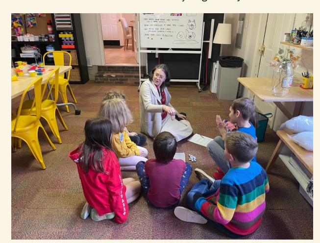
Learning about different holiday traditions