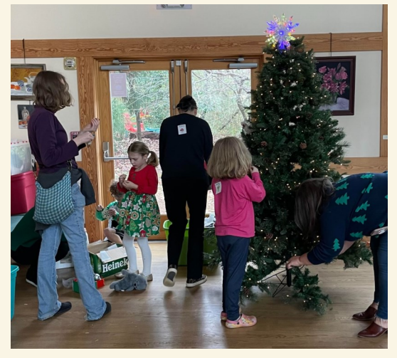
After enjoying a fun game between youth and adults, the kids worked hard decorating the tree