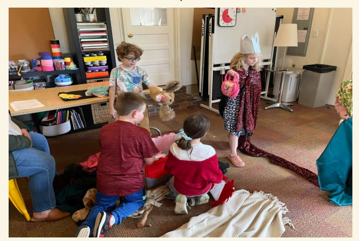
Dress up at rehearsal

The month of December was packed full of fun memories!