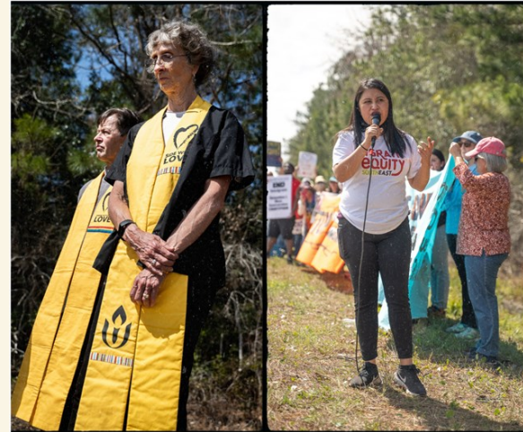
Georgia UU's Show Up as Allies to Protest the Expansion of the Folkston's ICE Detention Center

Good Trouble Congregations are congregations that answer that call to organize their communities and engage in the multiple and necessary tactics that will help us win big for our communities in 2022. Whether you're protecting voter access in Georgia, fighting for reproductive justice in Kentucky, or election protection in