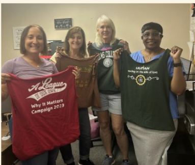
Dropping off the bags at NFCC.