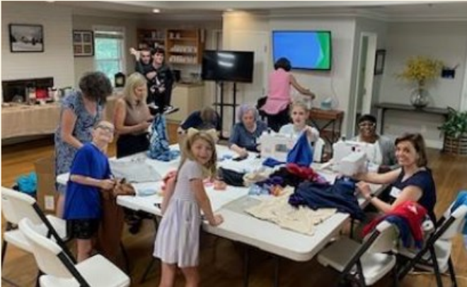
Cutting and sewing t-shirts to transform them into bags.

https://www.signupgenius.com/go/10C094BACAD2AA46-uuman#/