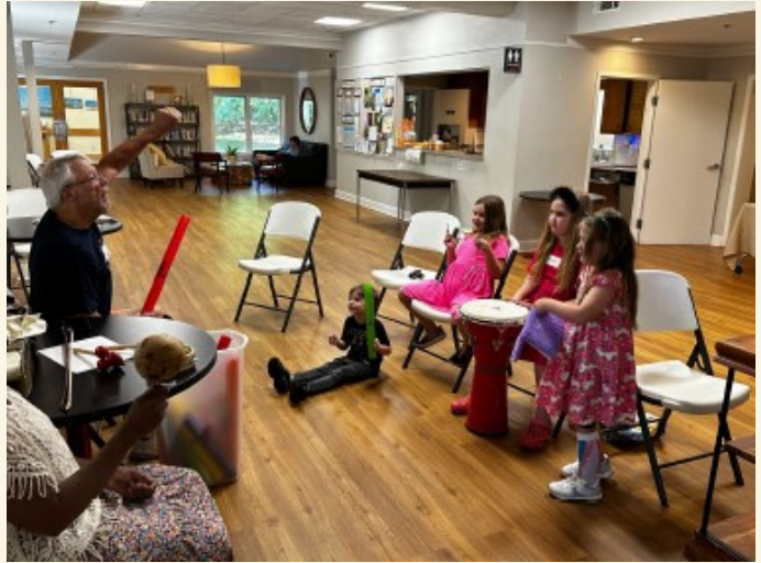
Making Music! Watch Video