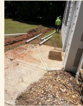
Figure 2 Pipe Installation