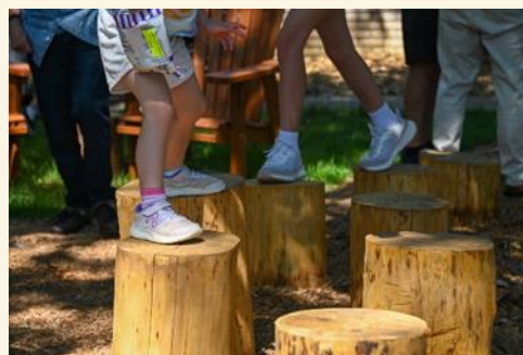
Kids loving the Stump Jump!