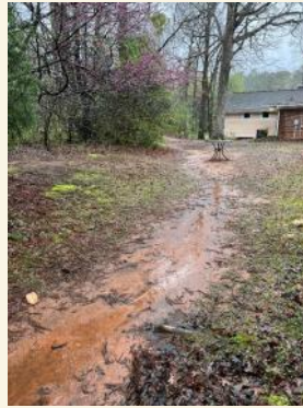
Figure 1 Some of the Mud!