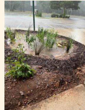
Figure 4 Rain Garden During Heavy Rain