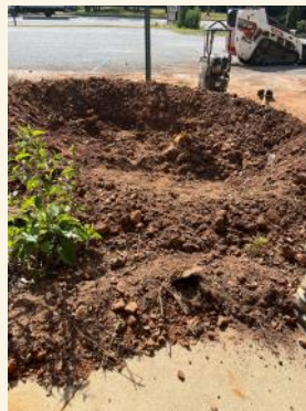
Figure 3 Rain Garden Under Construction