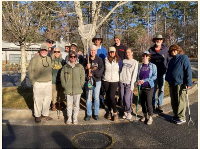
Our dedicated volunteers