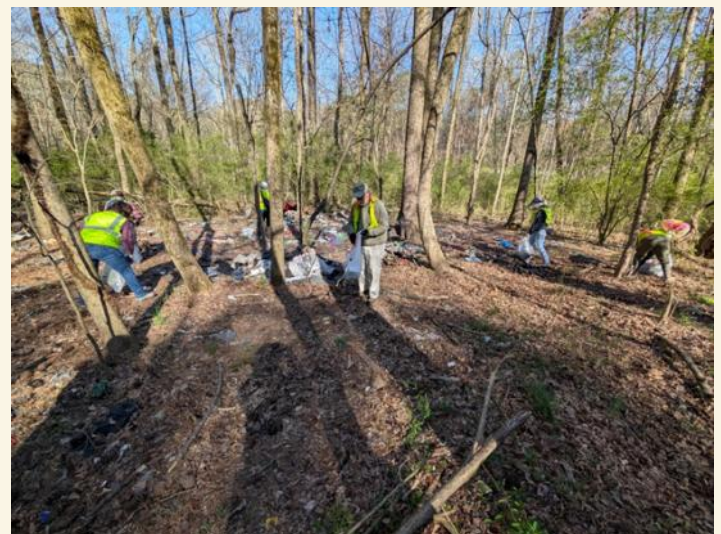
An old abandoned homeless camp we cleaned up