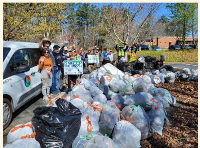
The results of our efforts